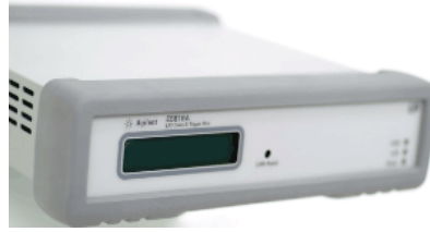
Performs IEEE 1588 PTP Synchronization over the Ethernet

You can communicate with the E5818 over a network in two different ways: either using the E5818 web access or by using a supported programming language with the Agilent IO Libraries Suite.