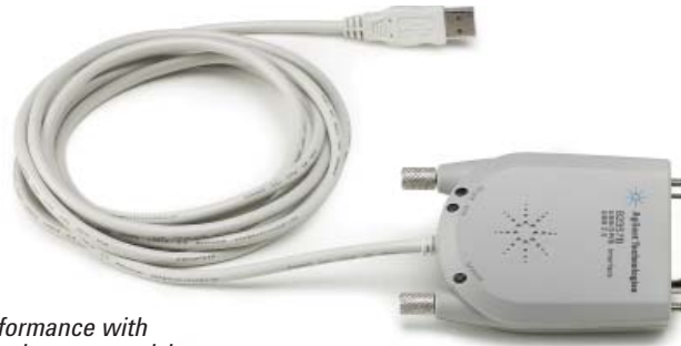
Boosting performance with simplest connectivity